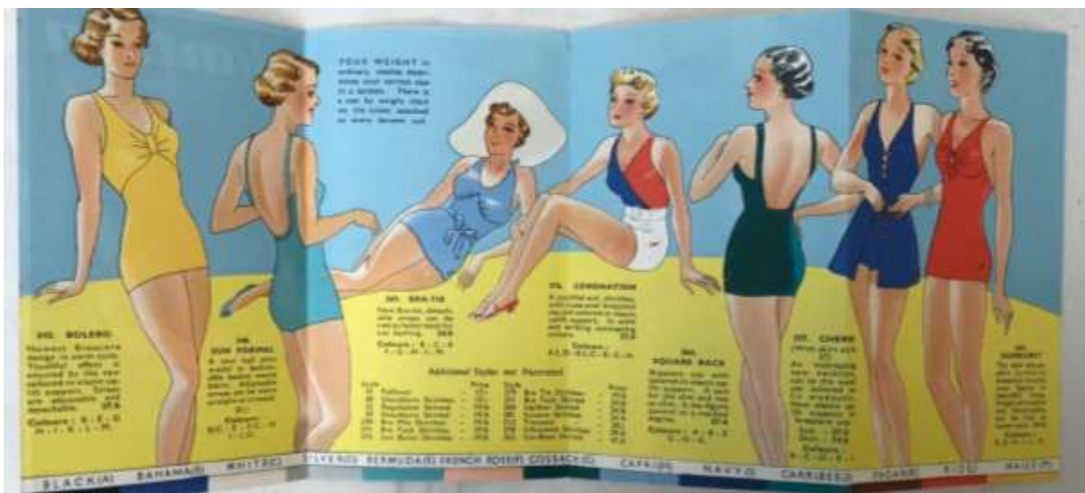
Figure 8. Jantzen Swimwear catalogue 1937, 1997/334, Worthing Museum.

The 1937 edition was the first to use coloured backgrounds for the inside of the Jantzen catalogue. It has illustrations of the swimsuit styles posed on models against a blue and yellow abstracted background, representing sand and sea, demonstrating swimsuit designs in their intended use at the beach [Figure 8]. Additionally, this catalogue talks directly to the consumer, indicated by statements such as ‘Your weight in ordinary clothes determines your correct size in a Jantzen.’ This catalogue emphasises decorative design and features text that speaks to the consumer rather than listing technical details, making a convincing case that this edition was produced for the consumer rather than retailer. Marks and Spencer also produced a comparable swimwear leaflet in the same period [Figure 9].