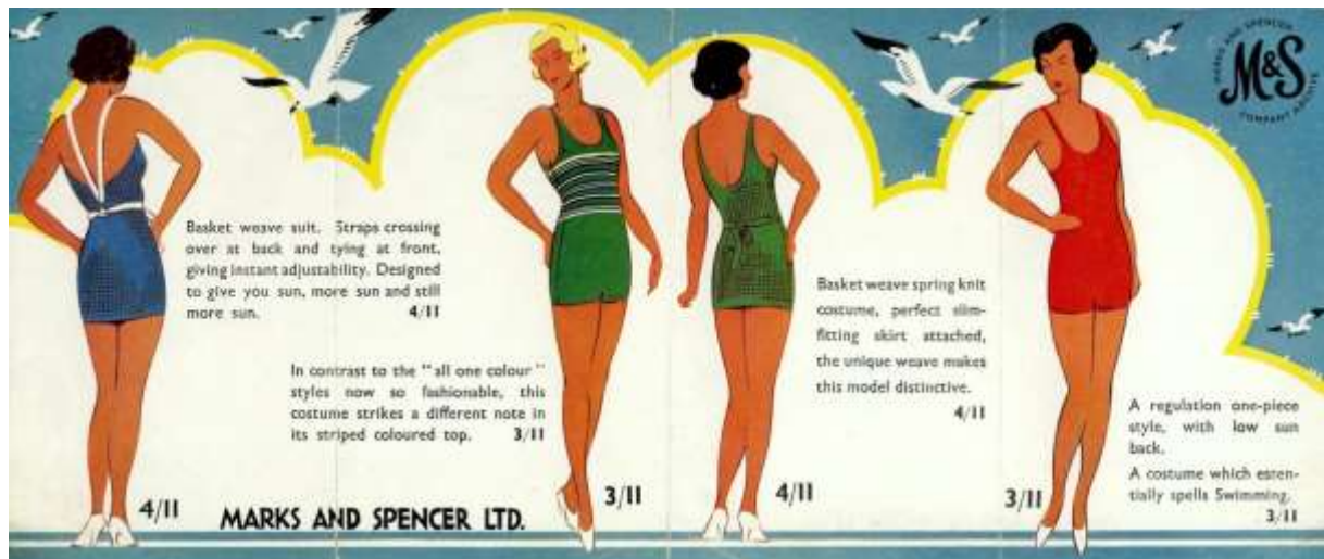
Figure 9. Marketing leaflet for swimsuits. C.1930. Marks and Spencer. Reference number: HO/11/1/5/27.

The changes in Jantzen's marketing aesthetics were also reflected in Hubbard's 1937 summer advertisement in the Worthing Herald [Figure 10]. It shows models, in an airbrush illustrated style, in diving action poses whilst wearing swimwear. The swimwear styles are not explicitly labelled as Jantzen and the iconic logo is not seen, although this is usually on the right-hand side and the image only shows us the left side of the bodies. They are, however, comparable to Jantzen 'Bra-Zip' styles that attached high-waisted trunks to a halter neck brassiere top with a metal zip [Figure 11]. This was a style that was a move towards the fashion for the two-piece bikini style.