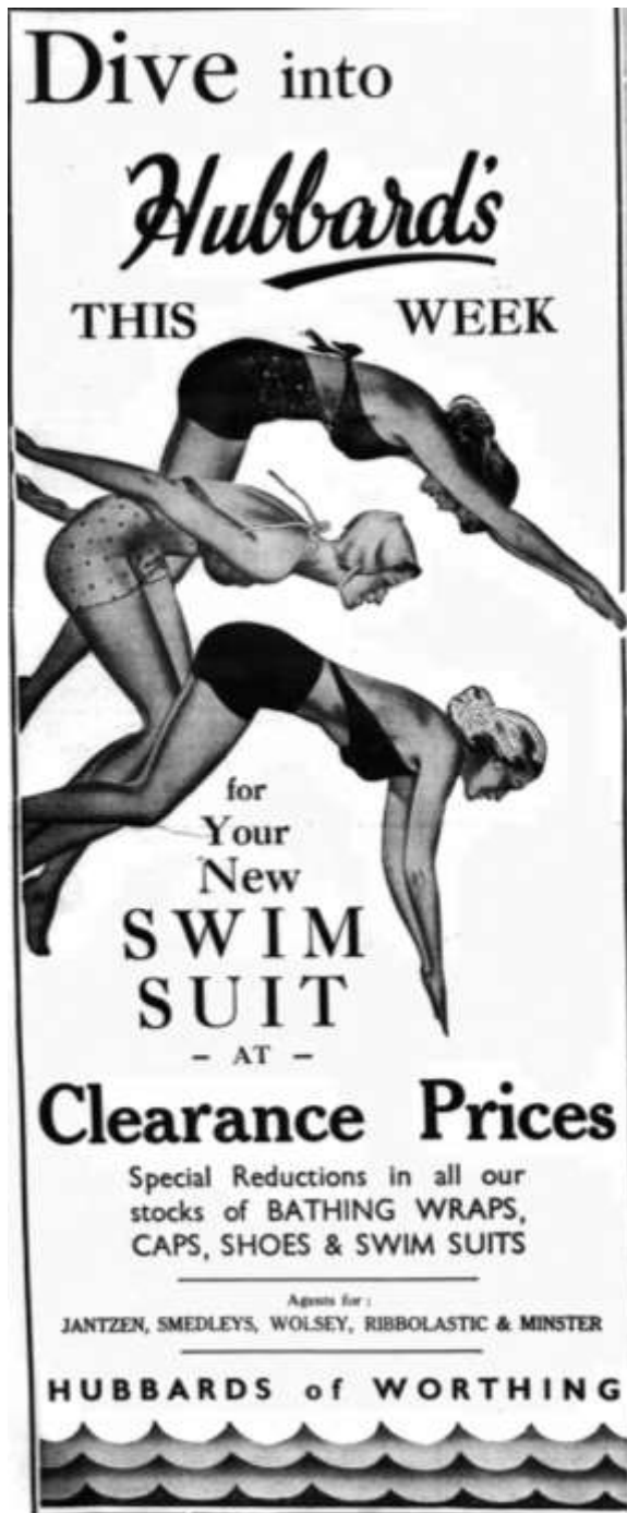
Figure 10. Left. "Dive into Hubbard's," The Worthing Herald, 31 st July. 1937:10.