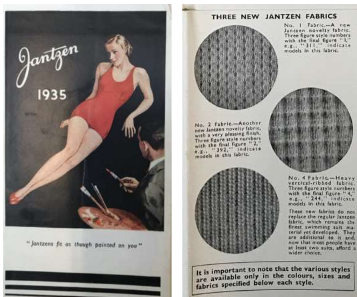
Figure 5. Left, cover. Right, inside. Jantzen Swimwear catalogue 1935, 1997/334, Worthing Museum.

The 1935 catalogue featured a painted interpretation of the Red Diving Girl motif with the caption 'Jantzen fit as though painted on you' [Figure 5]. It depicts a man, with artist's easel and brushes, painting a portrait of a woman wearing the iconic red Jantzen swimsuit. This alludes to the idea that Jantzen are master creators of swimwear.