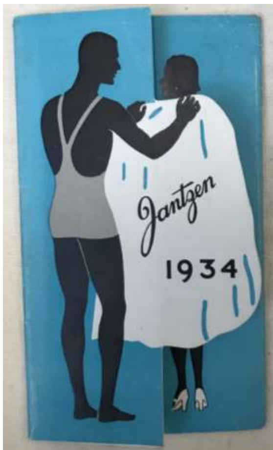
Figure 3. Left. Jantzen Swimwear catalogue 1934, 1997/334, Worthing Museum.