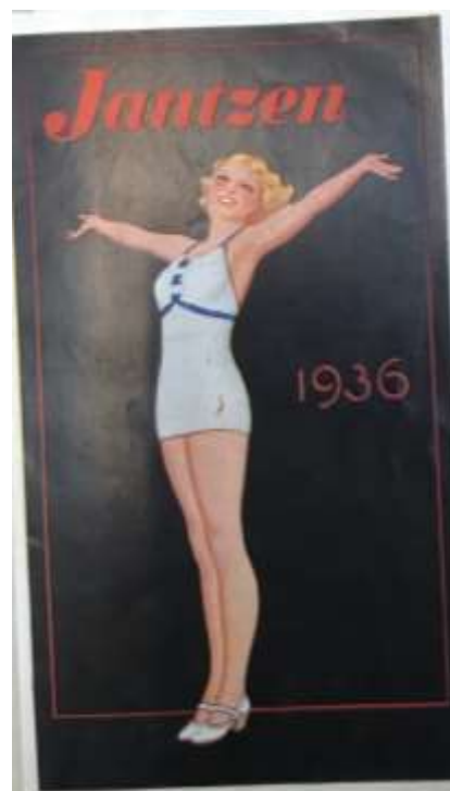
Figure 7. Jantzen Swimwear catalogue 1936, 1997/334, Worthing Museum.

The 1936 catalogue continues the use of realistic representations of models wearing Jantzen swimsuit rather than the highly stylised and abstracted graphics of the early catalogues. In the 1920s and 1930s Jantzen's marketing department hired leading illustrators to create advertisement materials [Figure 7]. This included the employment of George Petty, who brought a pin-up girl aesthetic to the Jantzen portfolio of the evolving Red Diving Girl. Petty used an airbrush style in the illustrations, which was distinct from the other illustrations seen in Jantzen advertisements so far. 10 This version of the Red Diving Girl was so successful that Jantzen created a Petty Girl swimming suit in 1940. 11 The longer legs and smaller head proportions of the Petty Girl published in the 1936 catalogue indicate another way that Jantzen evolved feminine ideals around women wearing swimsuits; it signals a move away from the athletic ideal in the 1920 original version of the Red Diving Girl.