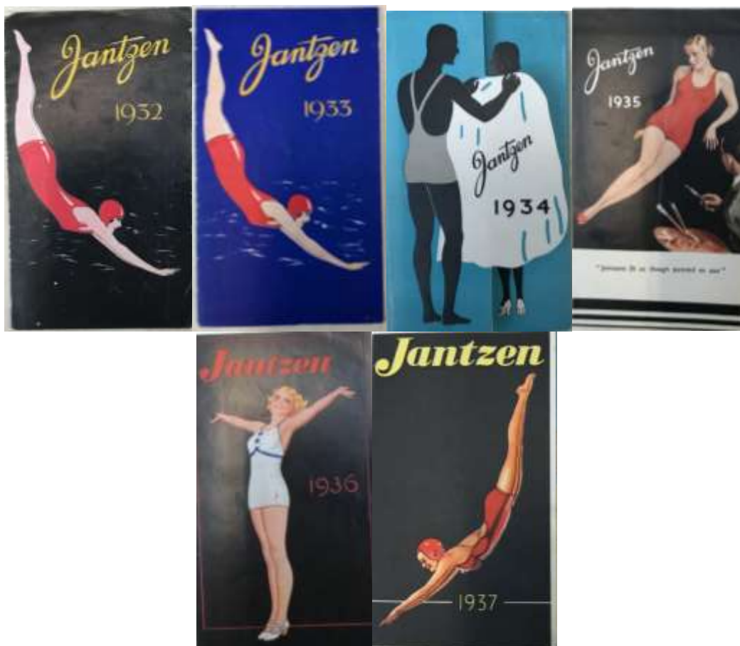
Set of Jantzen Swimwear catalogues 1932-1937, 1997/334, Worthing Museum.