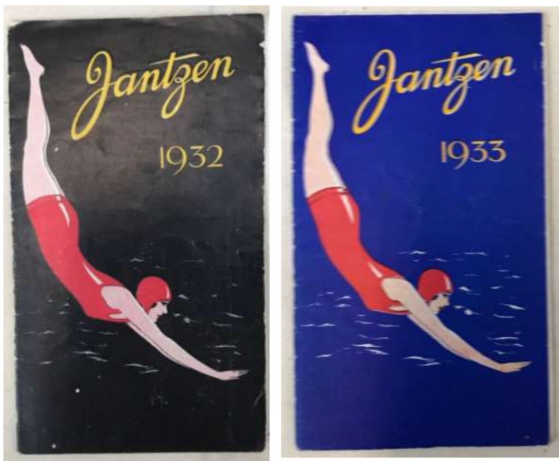
Figure 2. Jantzen Swimwear catalogues 1932 and 1933, 1997/334, Worthing Museum.