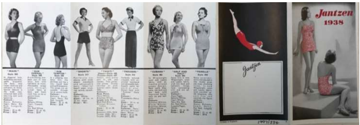
Figure 12. Jantzen Swimwear catalogue 1938, 1997/334, Worthing Museum.

The 1938 catalogue was the first to include photographic images of models wearing the swimsuit styles [Figure 12]. The front cover is a posed black and white photograph of models wearing swimsuits that have been coloured in red, thus referring to the “Red Diving Girl” logo. The showcasing of the yearly swimsuit styles were also photographic images. This change was not unusual for advertising in the 1930s. Design historian Marie-Louise Bowallius explains that ‘photography became more attractive to advertising agencies and increasingly out-rivalled colour and modern art as a means of arresting attention.’ This was because the photographs were cheaper than illustrations or paintings and it was found that they were more effective as an advertising medium. 12