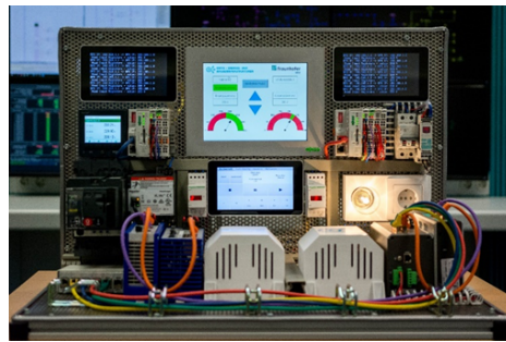
Fig. 1: Physical Setup of Training and Research Platform

2 Fraunhofer IOSB, IOSB-AST Görlitz, Germany dennis.roesch@iosb-ast.fraunhofer.de