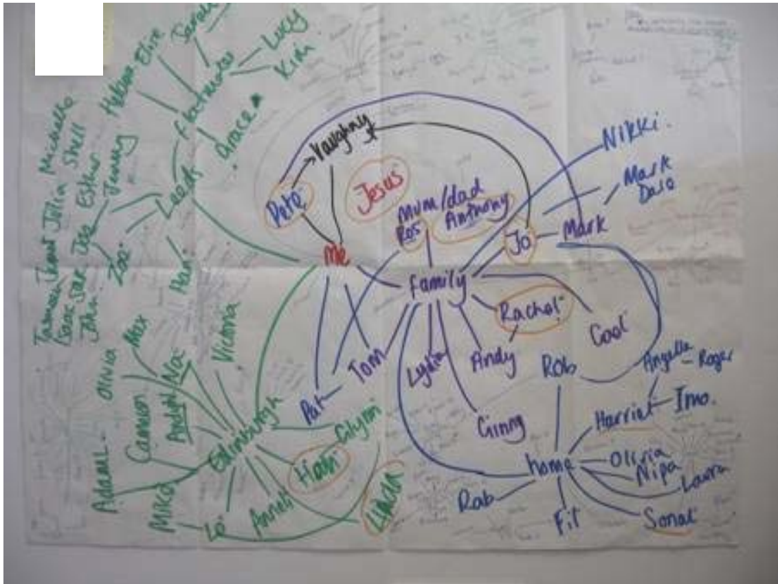
Figure 2: A participatory map from research to investigate social networks

The tangibility of the map is an important feature. This allows the interviewer and participant to return to features of the map in the interview and subsequent interviews to unfold the process of description—elaboration—theorisation. Figure 2 is an example of a participatory map, where the participant has chosen different colours to represent different categories in the map and mapped out relationships between the individuals and places considered.