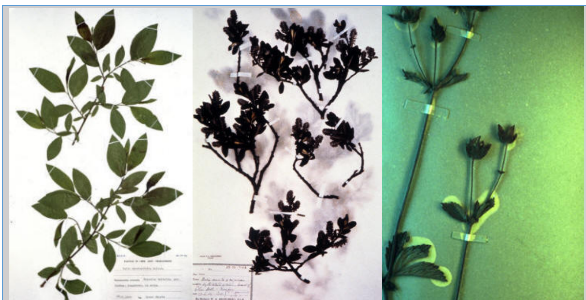
Figure 1: Specimens from the herbarium collection, National Museum Wales. The right hand image illustrates the fluorescence observed on the backing sheet under UV light (366 nm)

This research aimed to develop a simple, cheap and rapid screening method to identify the presence of mercury on plant specimen backing sheets. Since a significant proportion of backing sheets have historic significance, a non- or micro-destructive method was preferable.