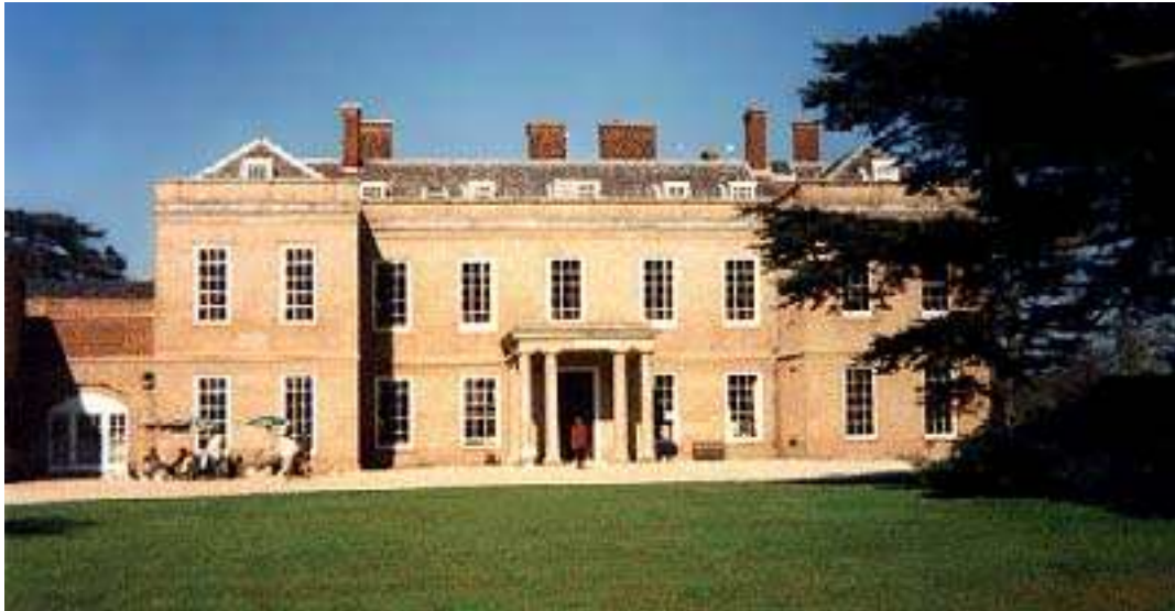
Swallowfield Park, Berkshire

Please note that this case study was first published on blogs.ucl.ac.uk/eicah in February 2013. For citation advice visit: http://blogs.ucl.ac.uk/eicah/usingthewebsite .