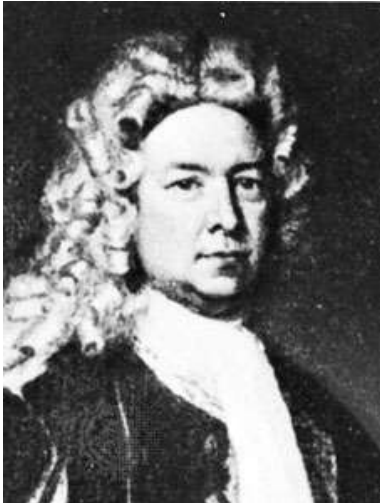
Thomas 'Diamond' Pitt Unknown artist

Born in Dorset, Pitt gained notoriety for his opposition to the East India Company's monopoly of trade on the Indian subcontinent. He first set sail for India in 1673, and rapidly established himself as a successful interloper in the Company's developing circuits of Asian commerce—much to the chagrin of the Court of Directors. Having returned to England in the 1680s, Pitt was elected MP for Old Sarum, and lambasted the Company's monopoly over Indian trade from the safety of his seat in the House of Commons. He journeyed back to India as an interloping merchant in 1693, forcing the East India Company's directors to reconcile themselves to his commercial presence on the subcontinent. Although Pitt remained estranged from influential senior figures in the Company such as Sir Josiah Child (c. 1631-1699) 4 , he secured appointment by the Company in the later 1690s as Governor of Fort St George at Madras (present-day Chennai). 5