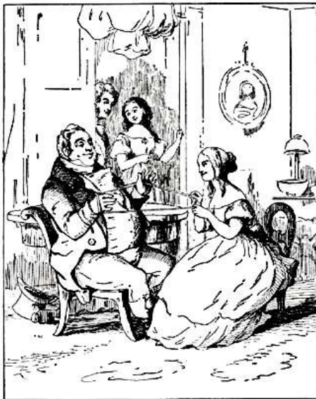
'Mr Joseph Entangled' Wood engraving, c.1861

Since its development in the 1760s, the image of the nabob has figured in British caricature as a quintessentially possessive individual. Consumed by his individual needs, addicted to Indian tastes and incapable of casting off his commercial origins to acquire gentility, the returned Anglo-Indian was a byword in Georgian England for the failure of social, cultural and national integration. William Thackeray, himself the son of an East India Company civil servant, captured this stereotype with great acuity in Vanity Fair (1847-48): his anti-hero, the returned Company official Jos Sedley, is an object of continuous ridicule for his failure to display English patterns of masculine behaviour focused on the social good.