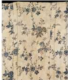
Chintz cape, Coromandel Coast, ca. 1775-1780 Cotton, printed and dyed Courtesy of Victoria and Albert Museum, London