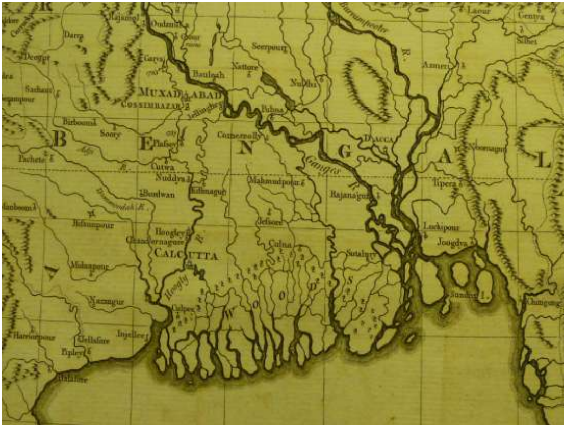
Part of a map of 'The Countries of Indostan East of Delhi' by Rennell published in "A History of the Military Transactions of the British Nation in Indostan" by Robert Orme (London 1778). Muxadabad was the former name of the Nawab of Bengal's capital of Murshidabad.

be thoroughly relied on” [f.n.Clive to Carnac 3 May 1765] and after Sykes had been sent to the darbar of the Nawab at Murshidabad he wrote “I need only add, that Sykes, for whom we intend the Residentsip, is a gentleman whose flexible integrity, and long experience in the country politics, we have reason to expect the most exact performance of every duty in such an important station.” [f.n.Clive to Court of Directors 30 Sept 1765]