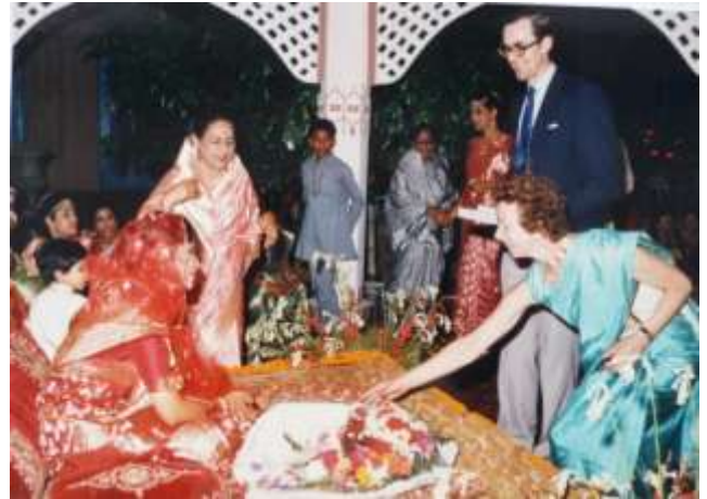
Presents for the bride