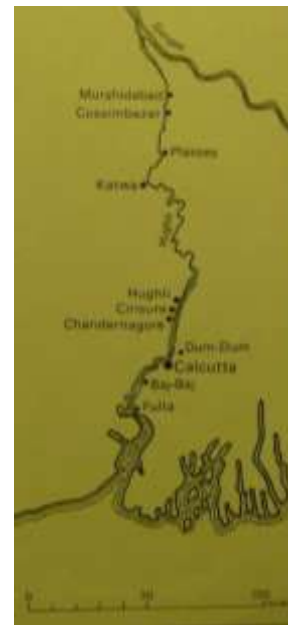
Map of the Hugli River