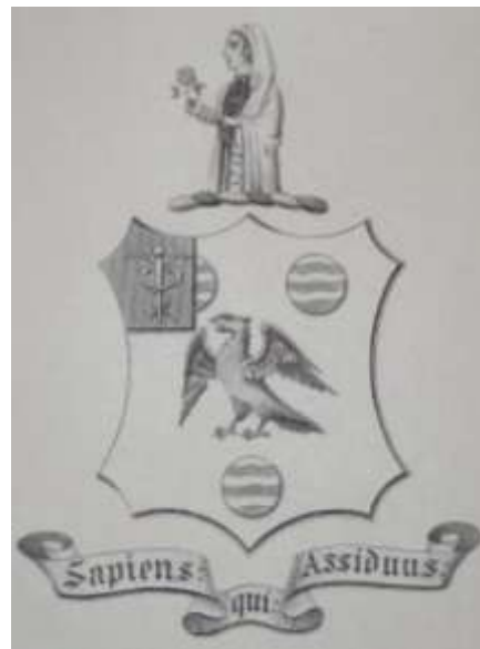
Coat of Arms of Sykes of Basildon