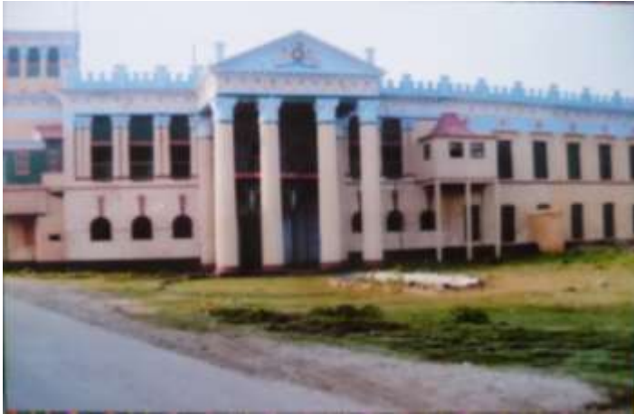
Sripur Palace, Cossimbazar