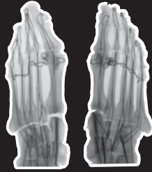
Image taken on behalf of Engle Entertainment for 'The Mummy Road Show' on National Geographic