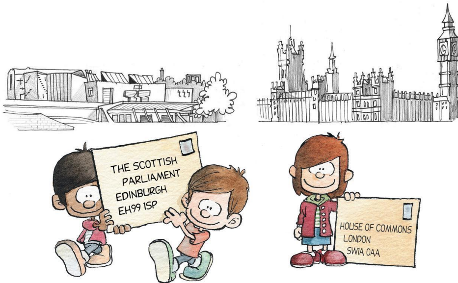
Illustration : alex leonard

The government should make sure your rights are respected