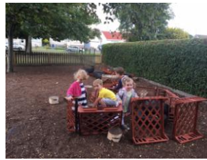
We can build a den when we work together!