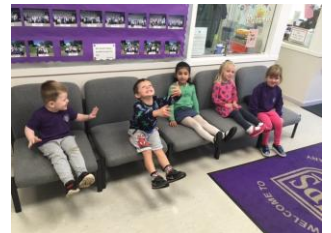
We went exploring around the school!