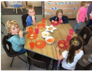
Socialising with our new friends at the snack table

At the moment, in Nursery, we are learning about friendships and nursery routines as well as Harvest and Autumn time. To help at home, discuss the changing seasons with your child and ask them to share some of our autumn songs we are learning!