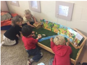
Retelling the Gingerbread man story together!

At the moment, in Nursery, we are learning about friendships and nursery routines as well as Harvest and Autumn time. To help at home, discuss the changing seasons with your child and ask them to share some of our autumn songs we are learning!