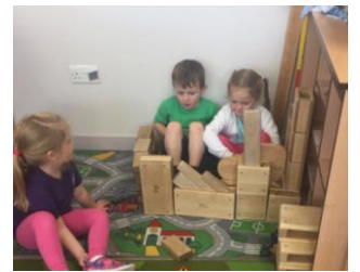
Very creative building!