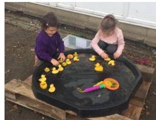
We are very busy outside!