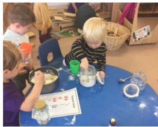
Working together to make play dough!