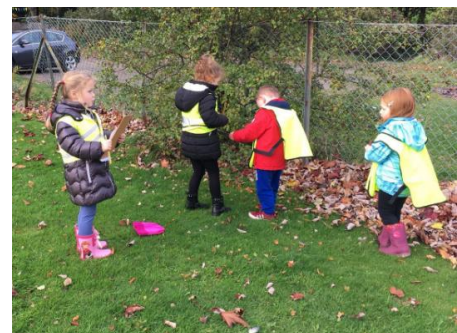
Working together to find signs of Autumn during our Autumn Walk.