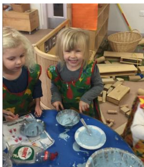
Experimenting with ingredients to make playdough.