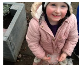
Learning about the cold winter weather!