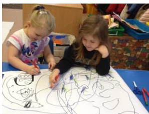
Working together to create a picture!