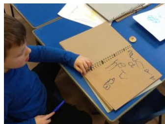
Lots of writing and mark making in nursery!