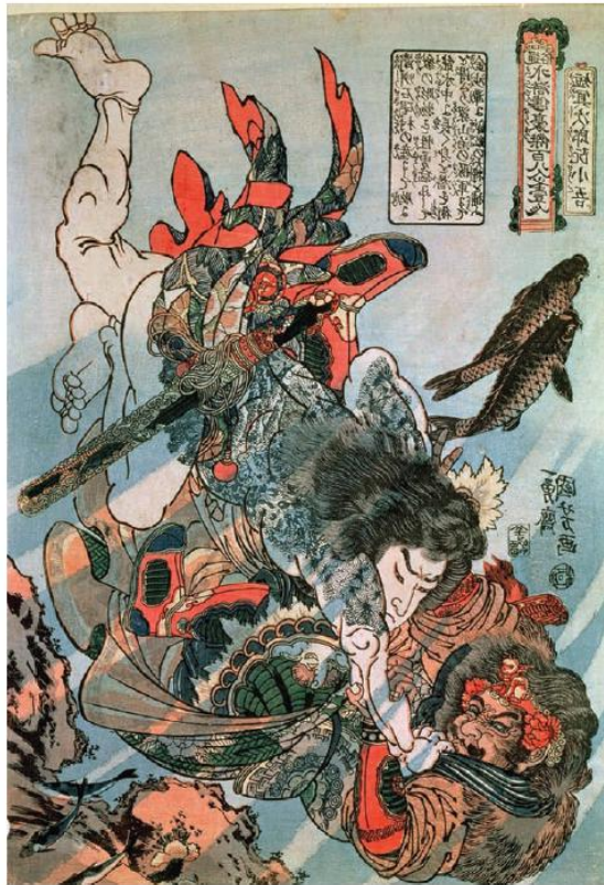
Tamejiro dan Shogo grapples with his enemy under water (1828-29) by Kuniyoshi woodblock colour print (36 × 25 cm)