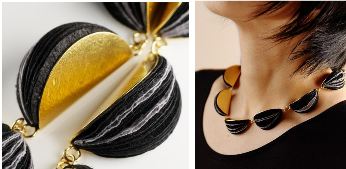
Necklace (Japanese handmade paper and gold plated white metal) Naoko Yoshizawa length 40cm