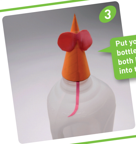
3 Put your mouse on the top of the bottle, then whack the bottle with both hands to rocket your mouse into the air!